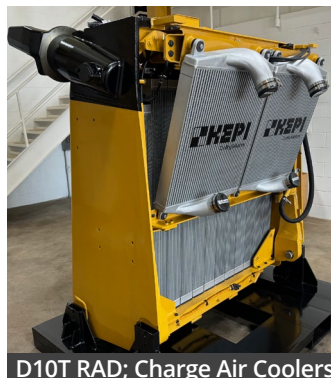
D10T RAD; Charge Air Coolers