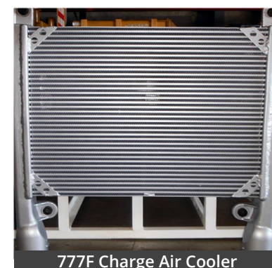
777F Charge Air Cooler