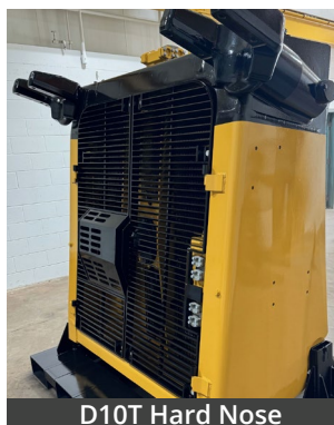
D10T Hard Nose