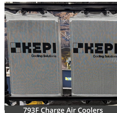
793F Charge Air Coolers