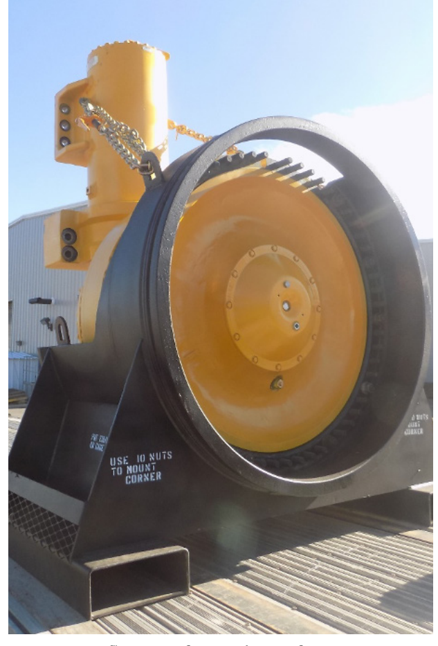
Birrana™ remanufactured 930E front corner

H-E Parts have the ability to supply service exchange wheel motors on certified transport frames, which meet load restraint guidelines.