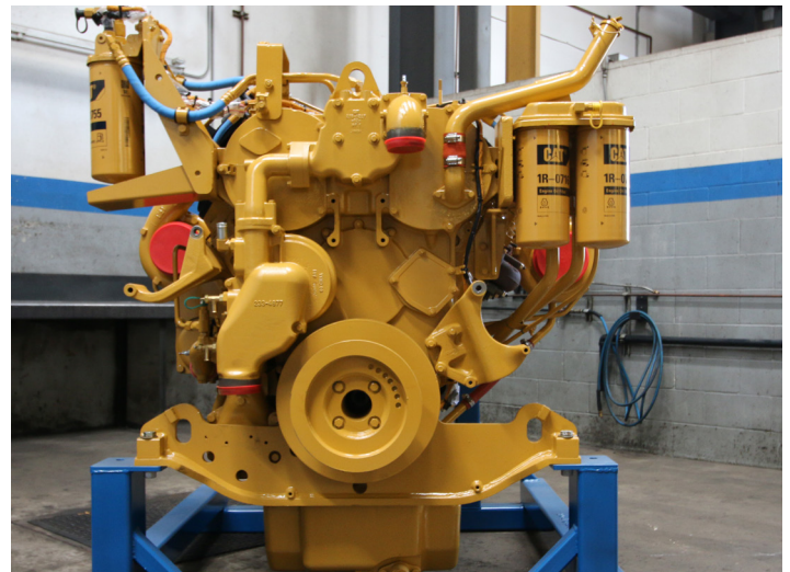
C27 StaTerra Power™ Engine

H-E Parts International replacement parts are compatible with the makes and/or models of the third-party equipment described. H-E Parts International is not an authorized repair facility of these third parties and it does not have an affiliation with any manufacturers of these third-party products. All brands, original equipment manufacturer (OEM) part numbers or references are owned by the respective OEM entities or their affiliates. These terms are used by H-E Parts International for identification and cross reference purposes only and are not intended to indicate affiliation with, or approval by the OEM, of H-E Parts International or its products.