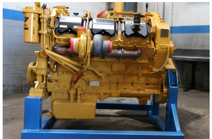
C27 StaTerra Power™ Engine