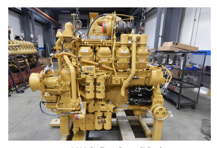
3508 StaTerra Power™ Engine